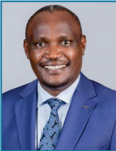
Hon. John Mbadi Cabinet Secretary, National Treasury & Economic Planning