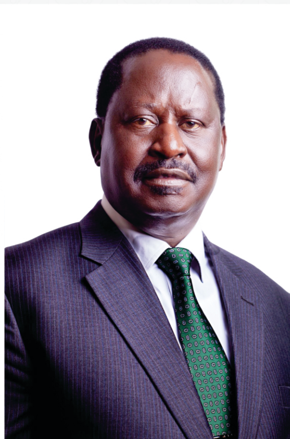
H.E. Rt. Hon. Raila Odinga