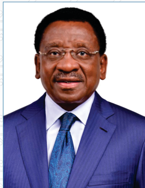
H.E. Hon James Orengo Governor, Siaya County (HOST)