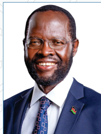
H.E. Prof. Peter Anyang Nyongo, Governor, Kisumu County & Chairperson of LREB