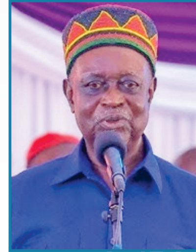
Hon. Oburu Odinga Senator, Siaya County