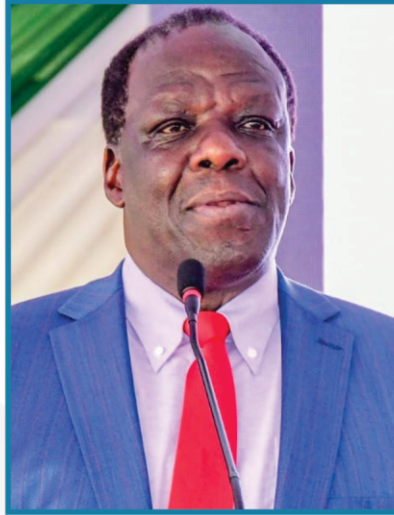
Hon. Wycliffe Oparanya Cabinet Secretary, Cooperatives & MSMEs