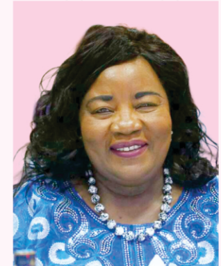
Dr. Ida Betty Odinga Woman trailblazer & Leader