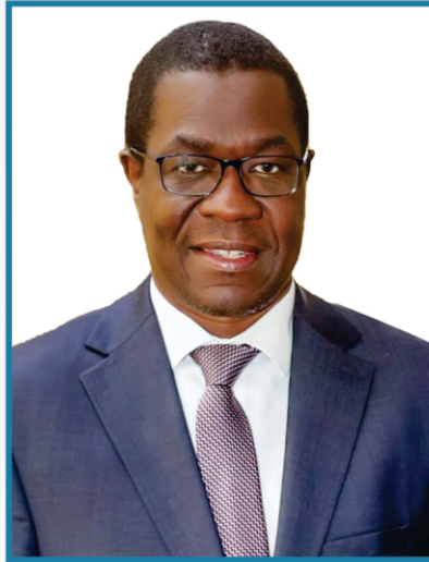
Hon. James Wandayi Cabinet Secretary, Energy & Petroleum