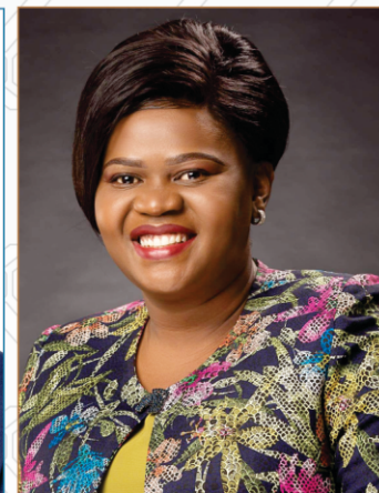
H.E. Hon. Gladys Wanga Governor, Homa Bay County