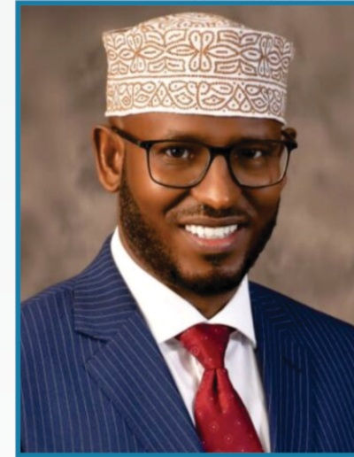
H.E. FCPA Ahmed Abdullahi ECG, Governor Wajir County & Chairperson of Council of Governors (CoG)