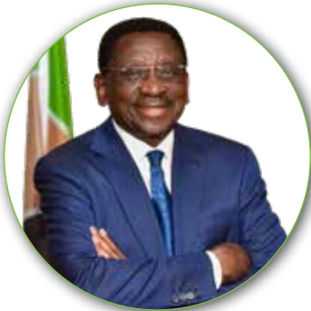
James Orengo Governor