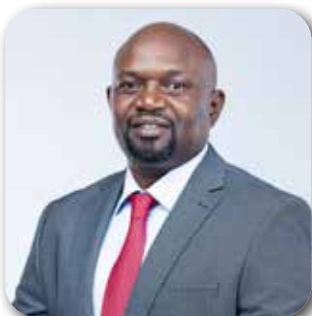
Hon. George Okode, MBS Speaker Siaya County Assembly