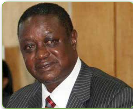
Hon. Dr. Oburu Odinga Senator