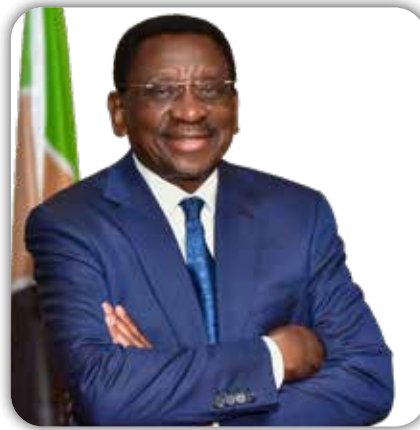
James Orengo Governor