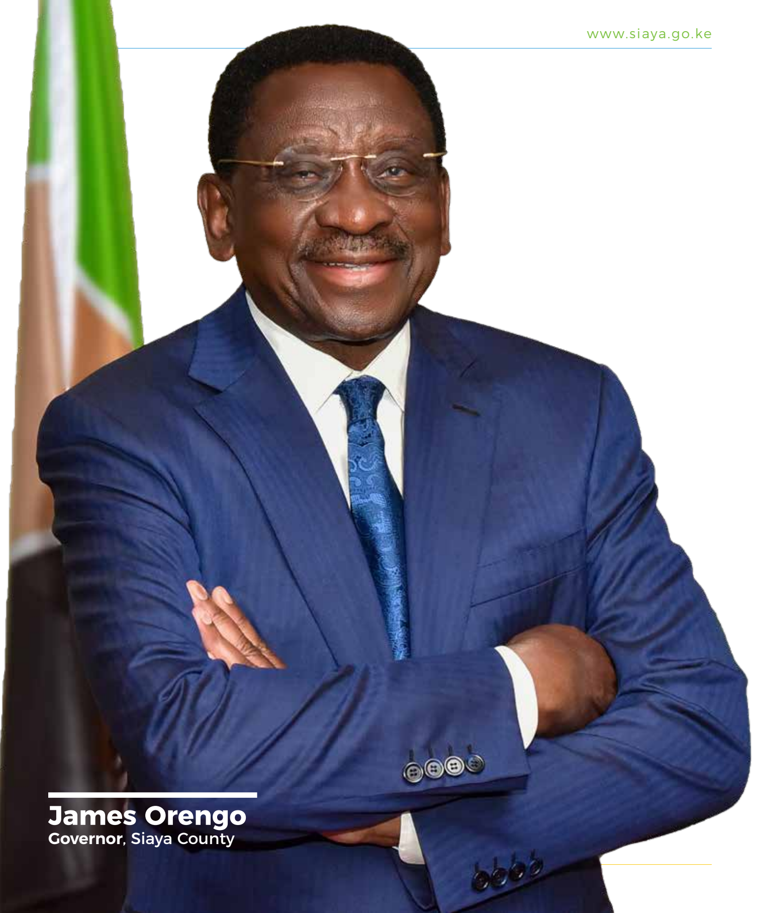
James Orengo Governor, Siaya County