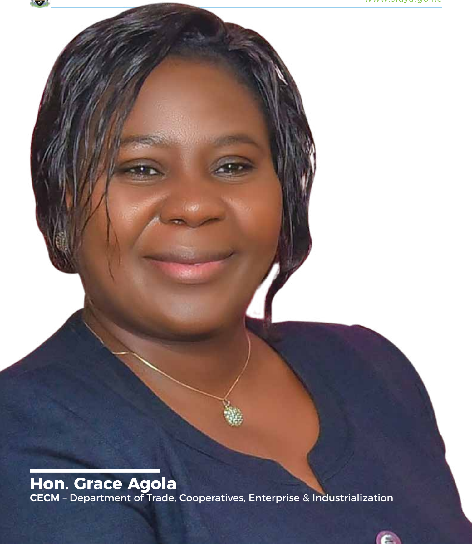
Hon. Grace Agola

CECM – Department of Trade, Cooperatives, Enterprise & Industrialization