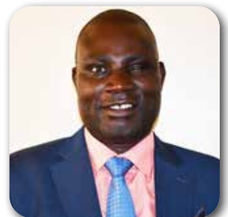
Hon. Andericus Oduor Odongo Deputy Speaker - County Assembly of Siaya